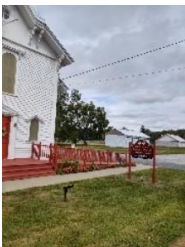
Our Church Sign is Back!

November 5 th 11:00am to 2:00pm Mark your calendars